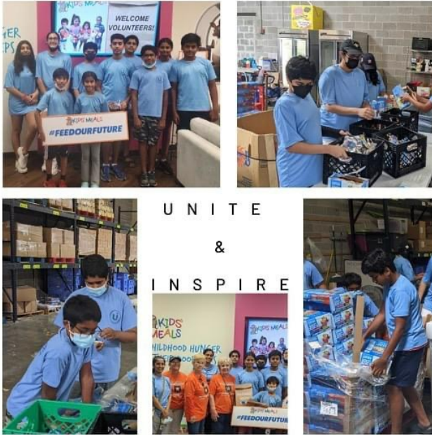
U&I volunteers in collaboration with Kids meals help unpack and prep for Meal bags