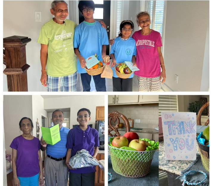
U&I volunteers celebrated grandparents' day by creating cards and gifting fruit baskets